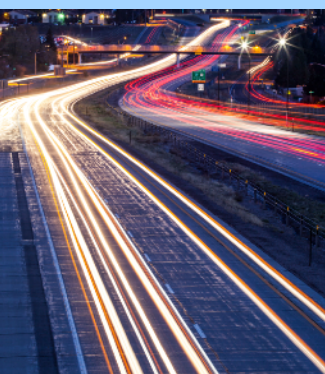
Exceptional Economic Development