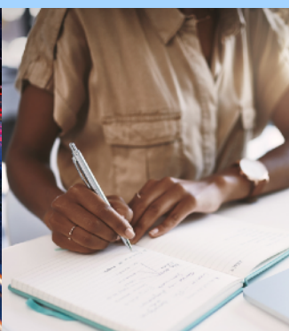
Innovative Talent Development