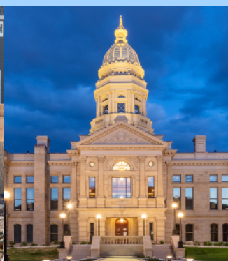
Relentless Action and Advocacy