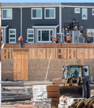
Transformative Community Development